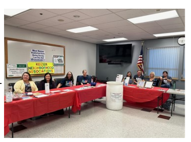
Representatives from Keizer Neighborhood Associations: Gubser, West Keizer, Greater Northeast Keizer, Northwest Keizer (left to right) sharing information and hosting a food barrel at the Keizer Fire Department open house October 7

Holiday Concert 7:00 PM Keizer City Hall. http://kcband.org