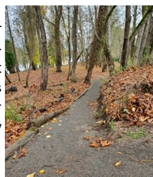
Newly created path in Wallace House Park

A service project was held at Wallace House Park on September 7, 2024. Over 150 volunteers showed up to help expand the pollinator garden and create new wood chip trails. Many thanks go out to the Latter-Day Saints Church participants, along with residents from the West Keizer Neighborhood, and members within Keizer community. The park looks terrific and has encouraged many types of wildlife, as well. Stop by and see for yourself!